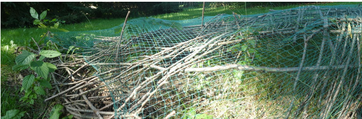
A Chinese protective garden net, over a fallen Kevin Giese sculpture, late August 2018

What use is your tangled hair, you fool? What use is your antelope skin? You are tangled inside...just making the outside pretty.