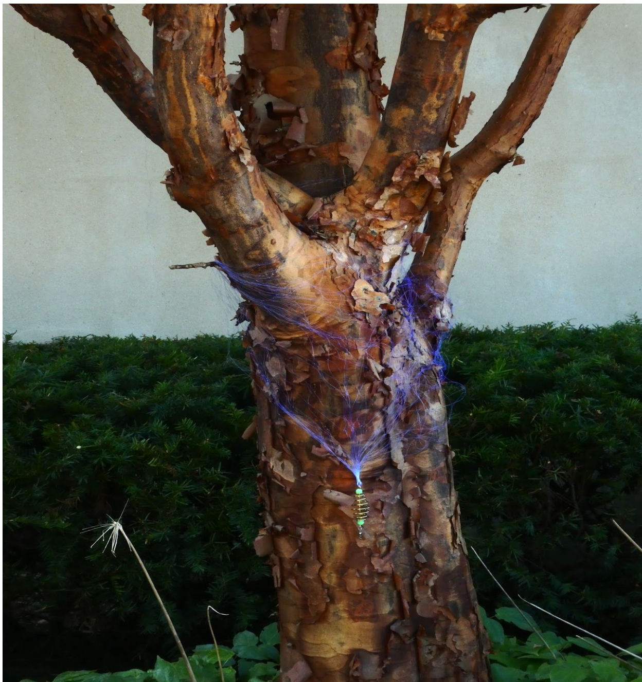
A Chinese Casting (fishing) net, one of two placed in early September 2018

Two more nets were placed around the trunks of trees in early September 2018.