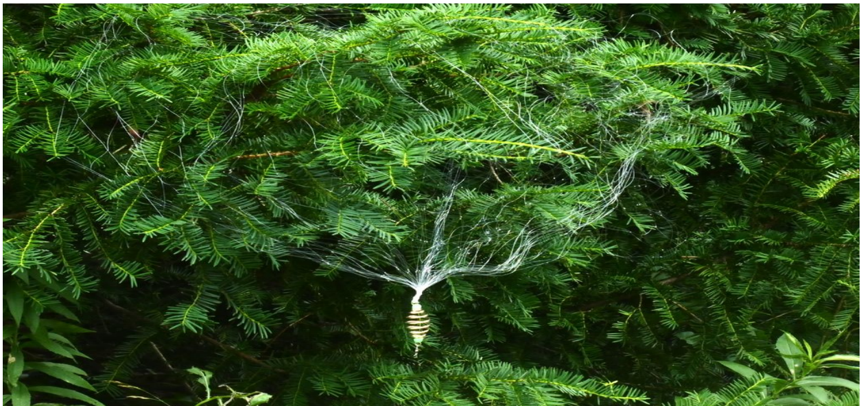
A Chinese casting (fishing) net, late August 2018

I placed the first nets, 4 of them, in late August 2018.