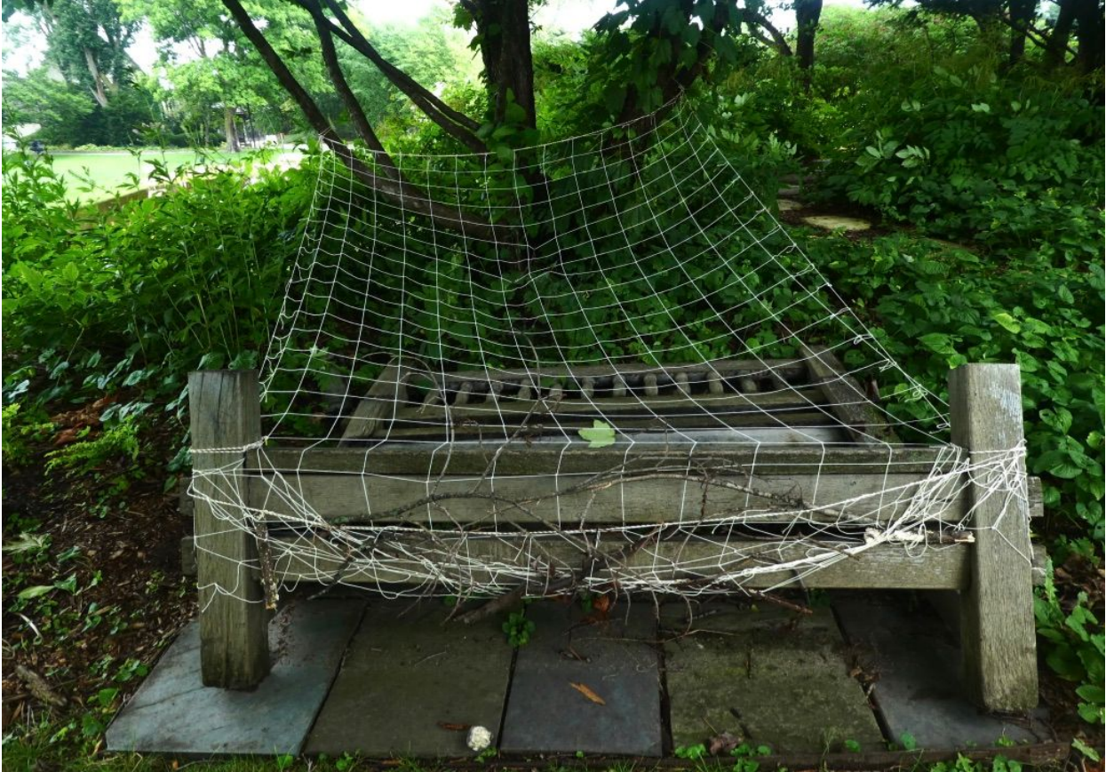
A Japanese bean net, late August 2018