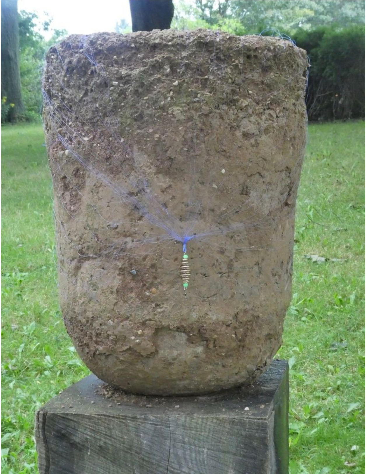
A Chinese casting net atop a Kevin Giese urn, late August 2018